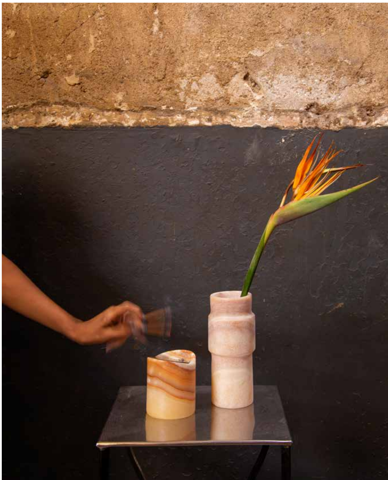
ASHTRAY FLIP ROSE ALABASTER | VASE ROSE ALABASTER

TIMELESS. From ancient times where man first started to carve the alabaster stone into today, the products merge ages into design. Byhand African Artisans create timeless interior that can adorn living spaces for generations to come.