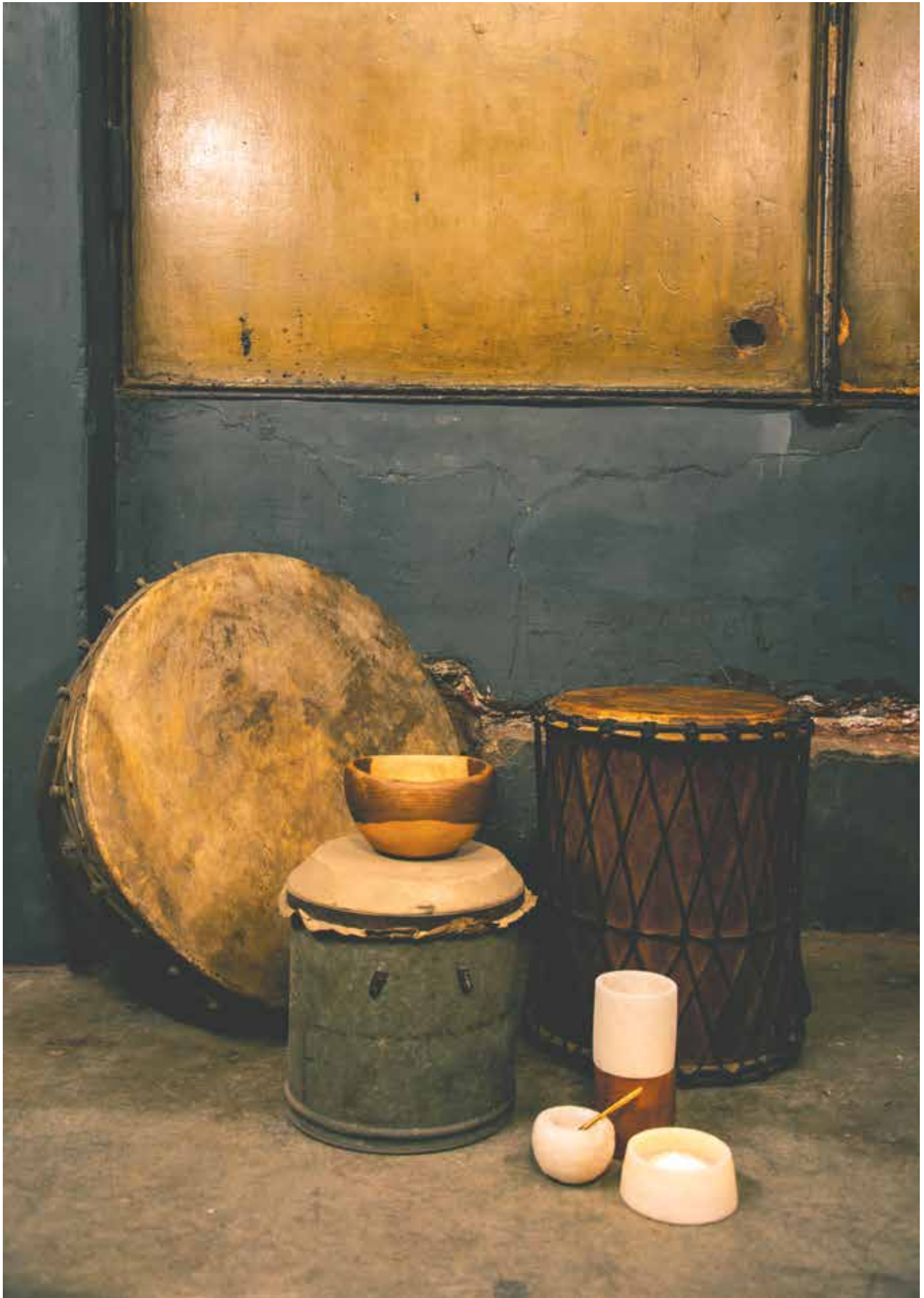
OLIVE WOOD BOWL | NUSSEN CANDLESTICK | SALT CELLAR | BOWL CANDLESTICK