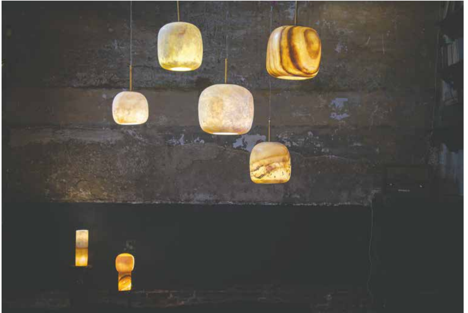
NUSSEN CYLINDER LIMESTONE TABLETOP LAMP | NUSSEN CURRA LIMESTONE TABLETOP LAMP | CURRA LIMESTONE PENDANTS

REAL-TIME. In a fast moving world where time seem to run on multiple dimensions simultaneously, the handmade is making opposition by being made in a real tangible time. From start to finish, the products goes from hand to hand. From human to human. One piece at the time. In this pace of movement the soul of each artisan gets to linger a bit with each design. In the end the designs are not only unique in their making but also in the way they are bestowed from one hand to another.