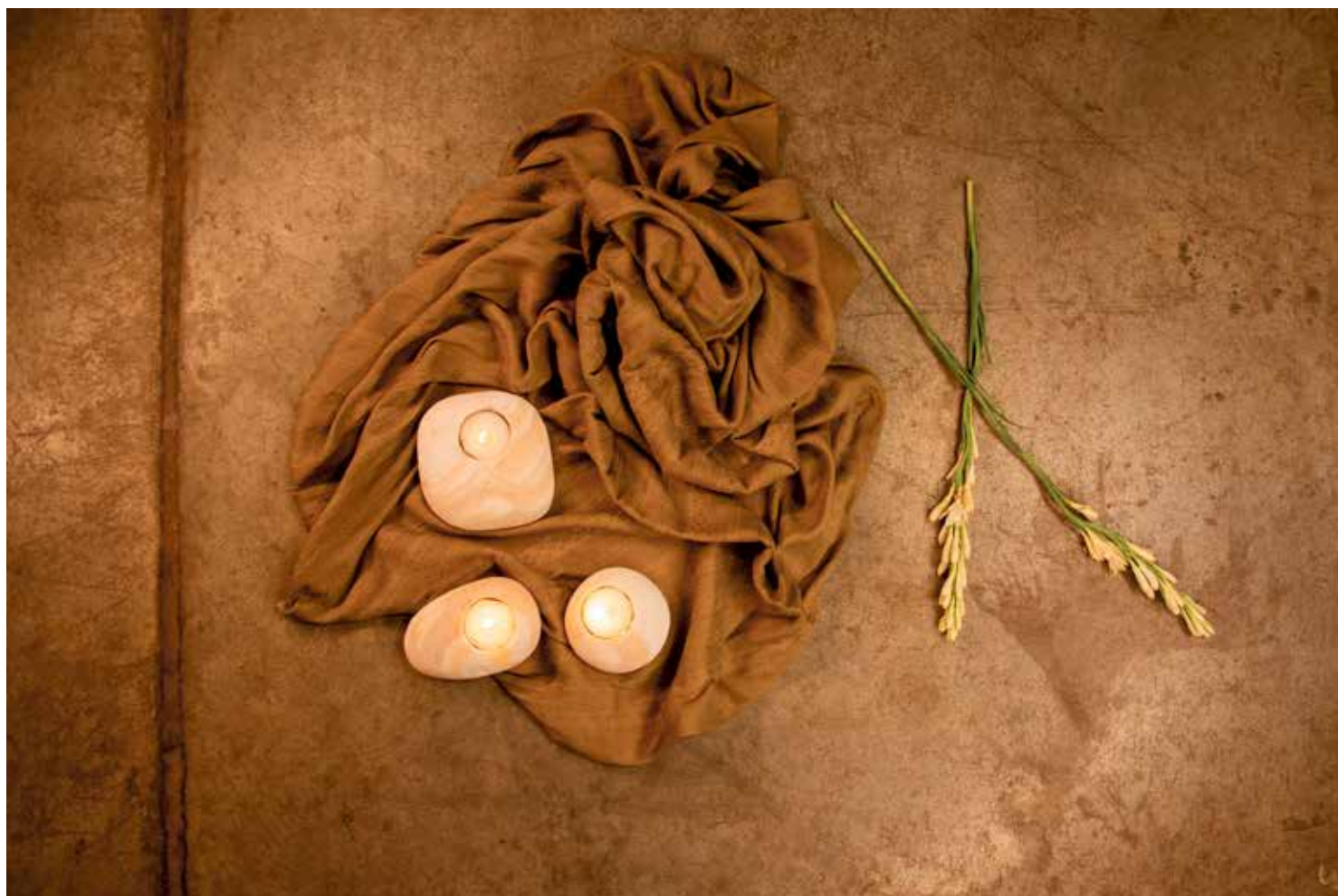
SALATA ALABASTER CANDLESTICK

INTERIOR. Since 2010 Byhand African Artisans is aiming to bridge the handmade ethnic design of Egypt and Kenya with a simple and minimalist Scandinavian approach to design. The outcome is gentle, material orientated designs that are functional without compromising on aesthetics.