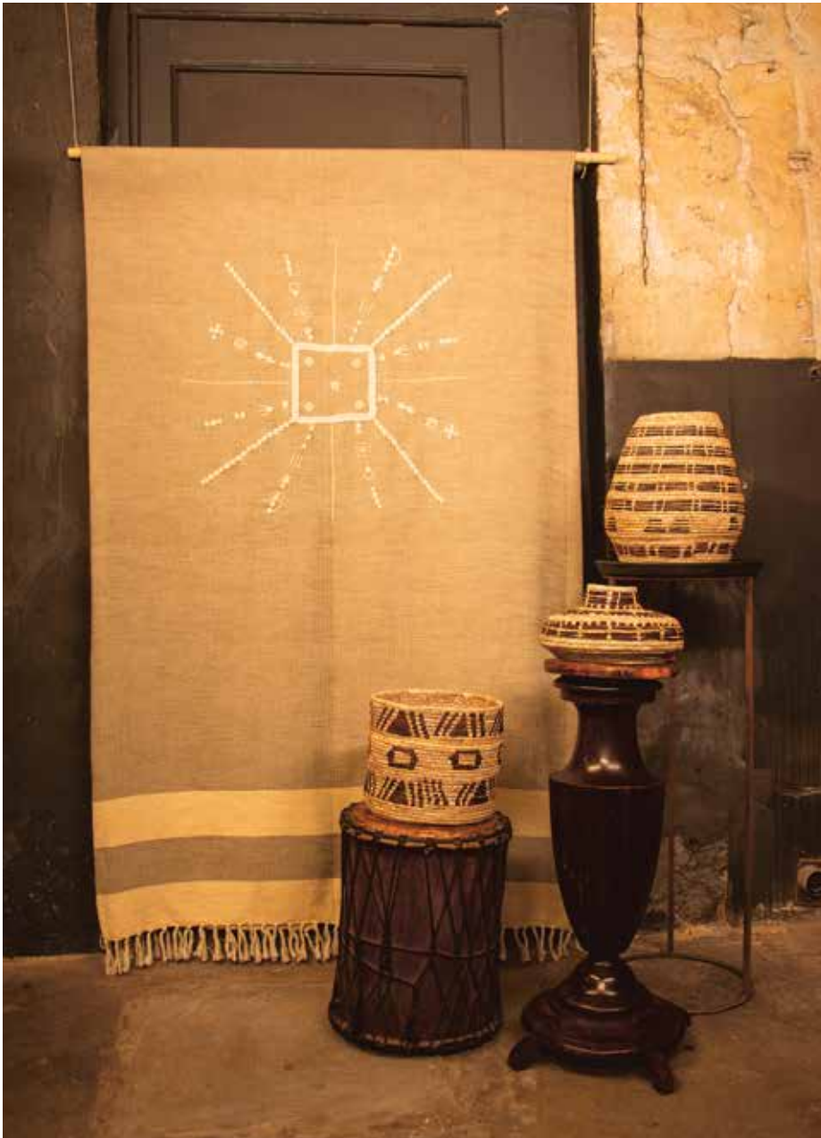
TWO KENAR THROW | BASKETS SHELATEEN