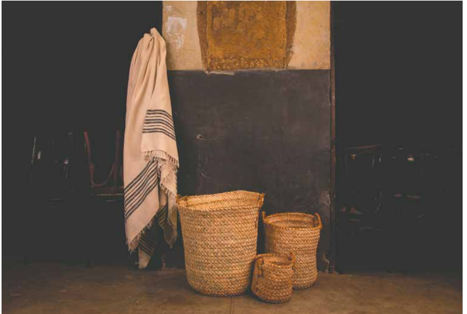
OSAMA SOFT THROW | ALGARA PALMTREE BASKETS