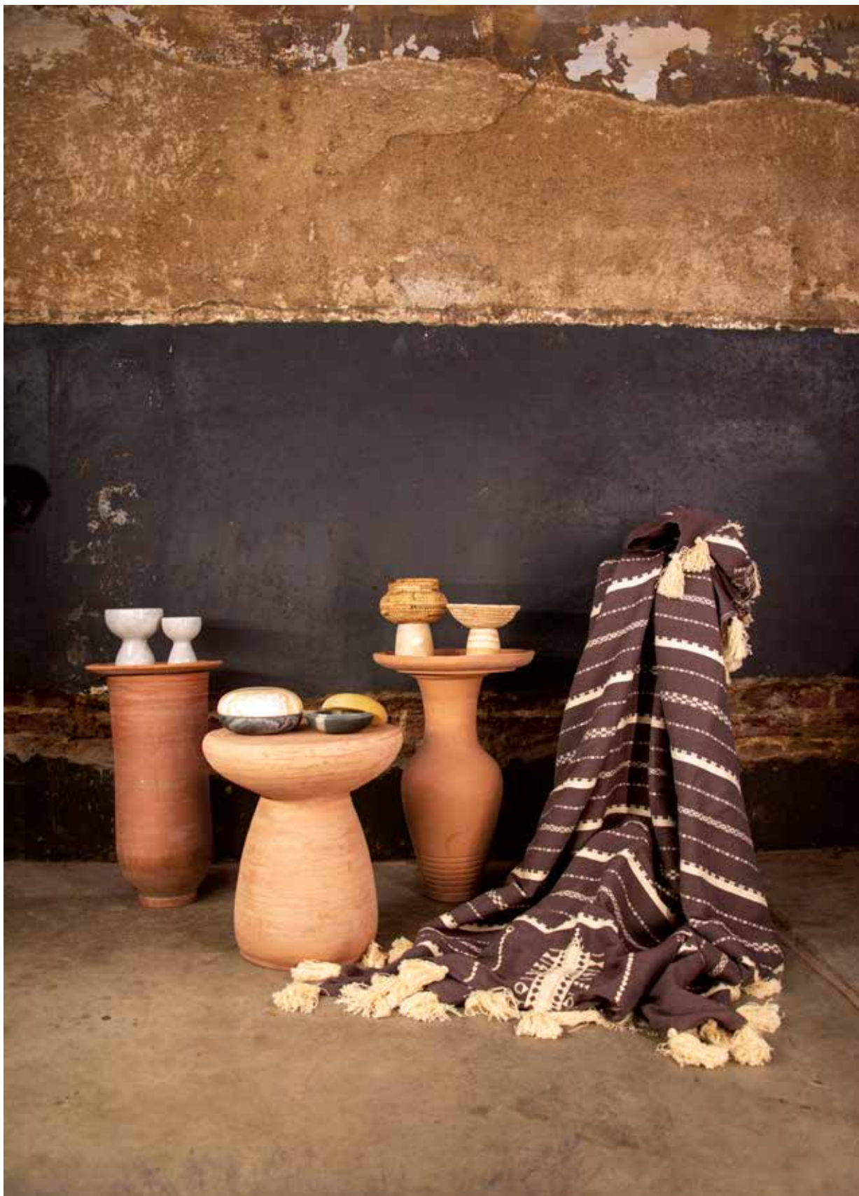
LOTUS CUP MARBLE | BOX SANDOUK ALABASTER | FRUITAGE MINI | THROW TRADITIONAL AUBERGINE

LIVING. Byhand African Artisans designs interact in daily life as subtle reminders of other cultures and the artisans behind. The pieces explore the field extending from functionality to enrichment of the spaces we inhabit. It is durable designs that allow spaces to be used and made into living homes.