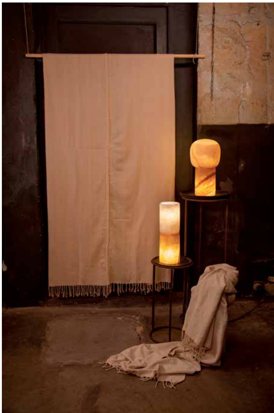
AKHMIM FLAT THROW | AKHMIM STRUCTURE TOWEL

HANDMADE. Byhand African Artisans is handmade design in natural materials. Each piece of stone is carefully selected, each embroidery reflects the thoughts of the woman behind it. The handmade product reaches into corners and geographical areas that the commercial production cannot. Thus creating livelihood and independence in small communities in pockets around Africa.