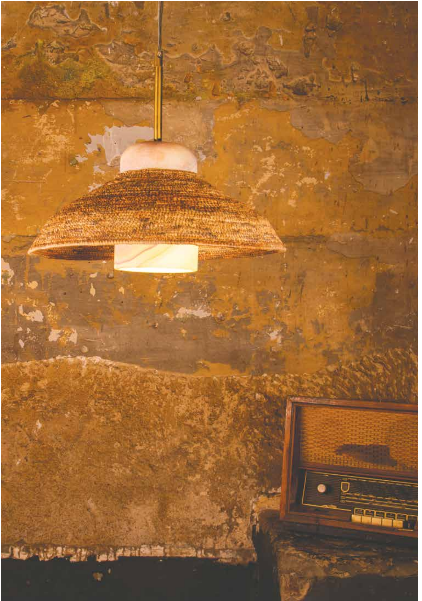
V3 FLOATING BANANA PENDANT ROSE ALABASTER