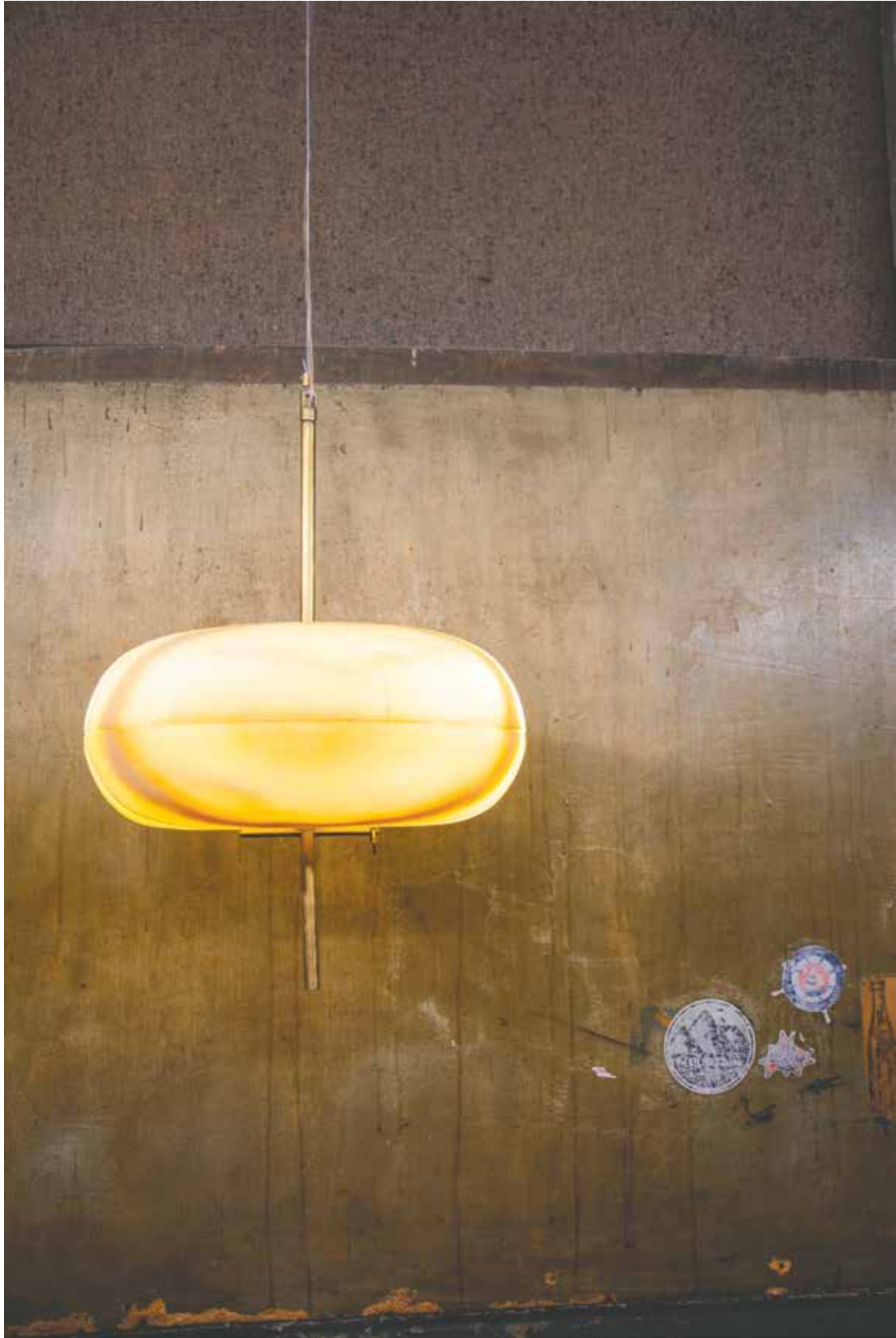
DINING ALABASTER PENDANT

HERITAGE. With an emphasis on enhancing the local artisanship through continuous development, the annual collections breathe life into traditions on the verge of extinction and techniques of craftsmanship that has been handed down from artisan to artisan through generations.