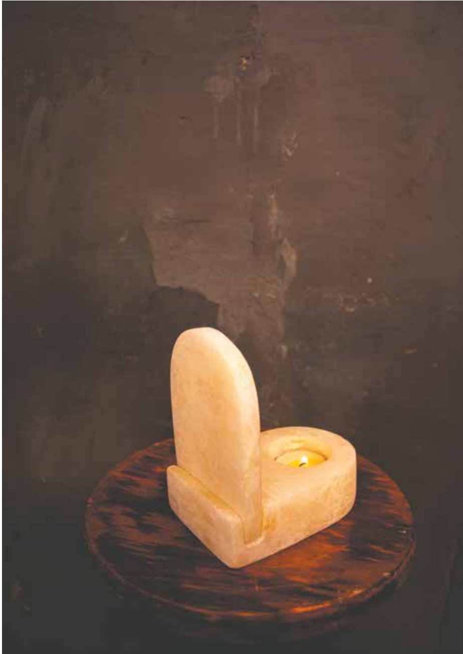
LIMESTONE REFLECT CANDLESTICK

SLOW DESIGN. As the world continues to use its resources faster than they can reproduce the responsibility of us as designers is to lead another direction. A direction where the reserves we use can be cherished and loved through generations. Where each piece of stone we cut, each gallon of water we use is acknowledged as the beautiful ancient riches it is. By tapping into the Earth's natural resources we are working with pristine materials and every step we take to refine and unveil its unique beauty must make it worth it.