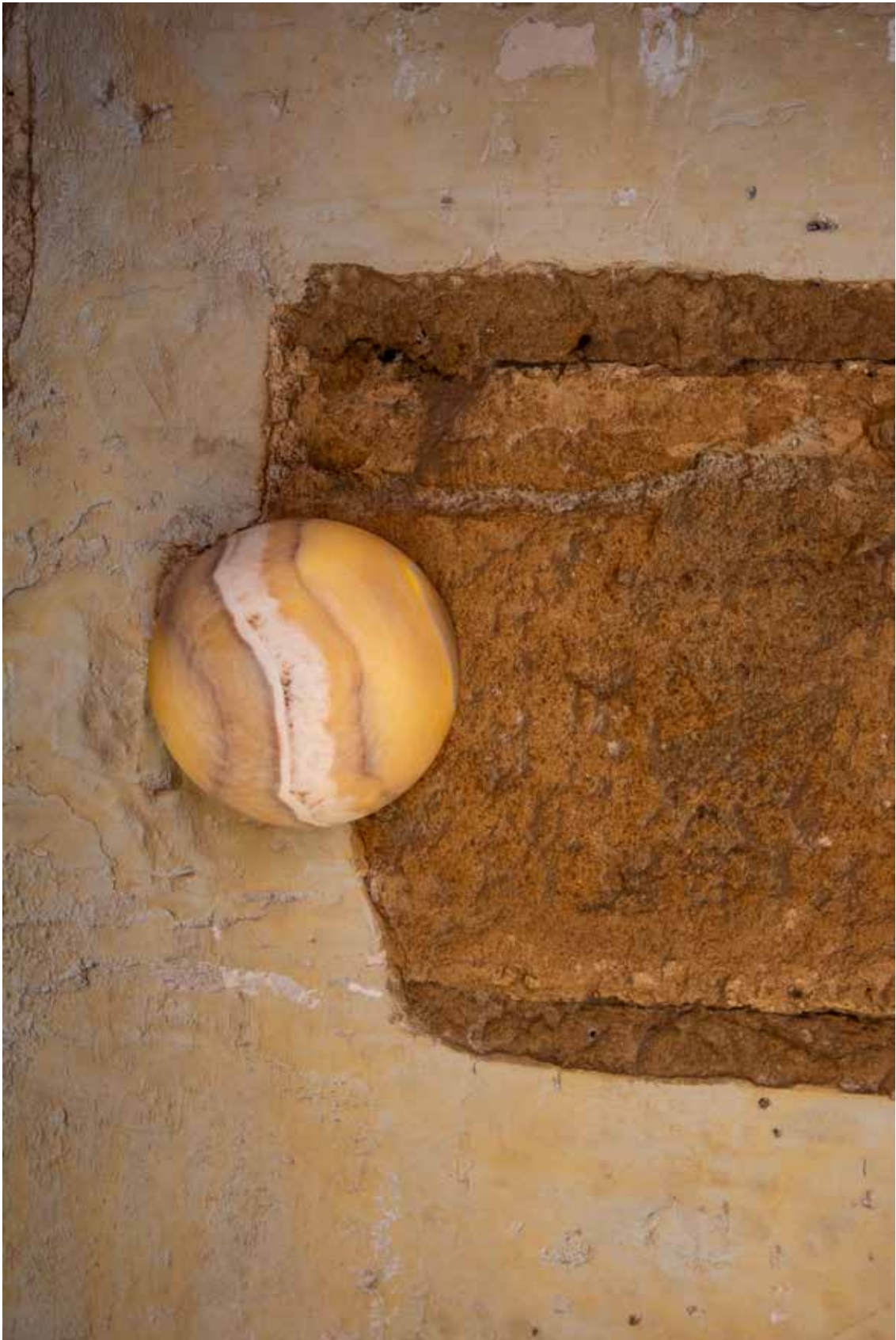
MOON ALABASTER WALL LAMP